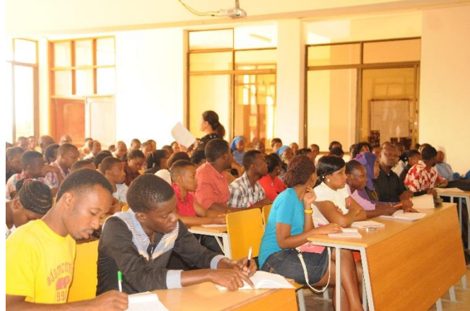
SAUT Business Administration Lecture

WHE would like to thank all donors, particularly Western Housing and The Book Store for their significant contributions.