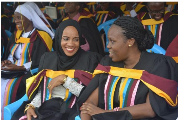
MBA Graduates during graduation ceremony at SAUT

These textbooks will be placed in SAUT's library which has various sections according to the Faculties/Schools.